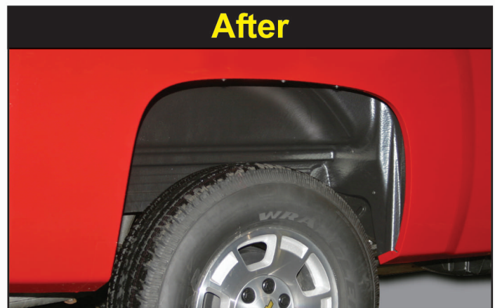
Covers Inner Wheel Items

Installation 15 Minutes (Tire Removal Is Optional For Installation)