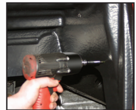
Install 4 screws