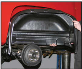
Put liner in well

Installation 15 Minutes (Tire Removal Is Optional For Installation)