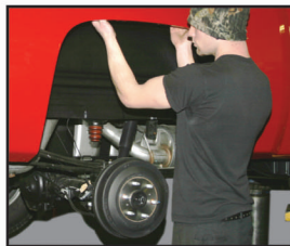
Tuck in all 3 sides under wheel well