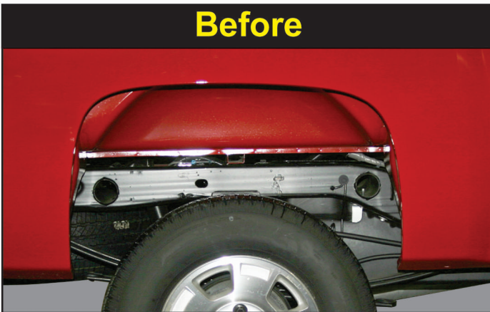
Exposed Frame Rail, Leaf Springs and Shocks